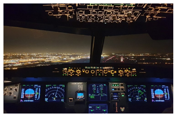
Landing in Paris a few days ago

A piece of advice I would give to whoever is reading this. You may not know what you want to do next, but like I did, and as the saying goes 'do what you love and you'll never have to work a day in your life'. If becoming a pilot is your dream, I wish you all the very best. Training is an adventure yet the job really is the best in the world!