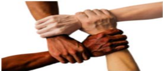
General Support and Guidance