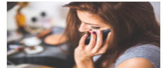
LA Parent Helpline Links