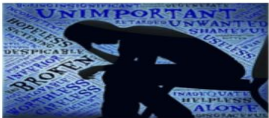
Low Mood and Depression