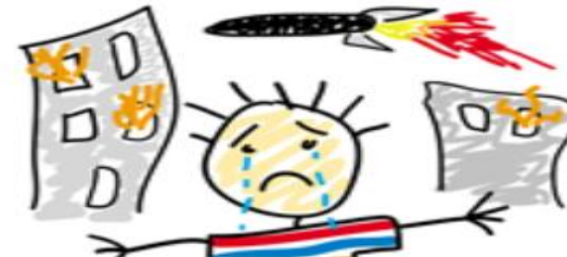
Child Bereavement/ Traumatic Events